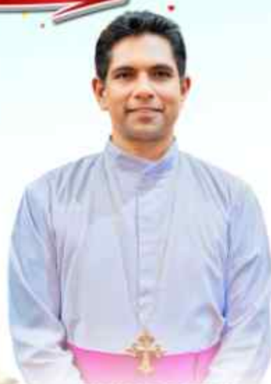
BISHOP JOSEPH THACHAPARAMBATH CMI DIOCESE OF ADILABAD