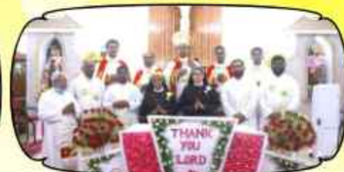
CMC Jubilee (04.10.2025)