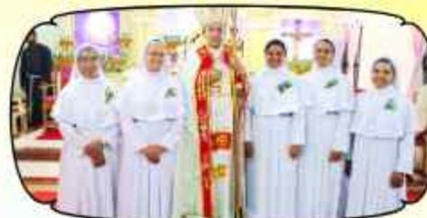
MSMI Jubilee (30.09.2025)