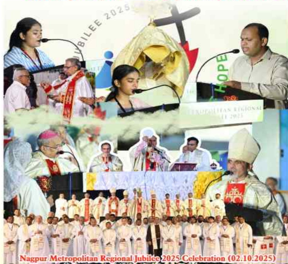
Nagpur Metropolitan Regional Jubilee 2025 Celebration (02.10.2025)