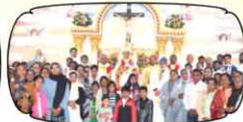
Hinganghat Church Jubilee (30.11.2025)