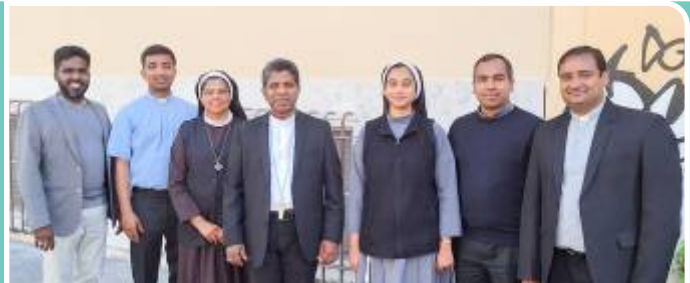
With Thuckalay priest and sisters