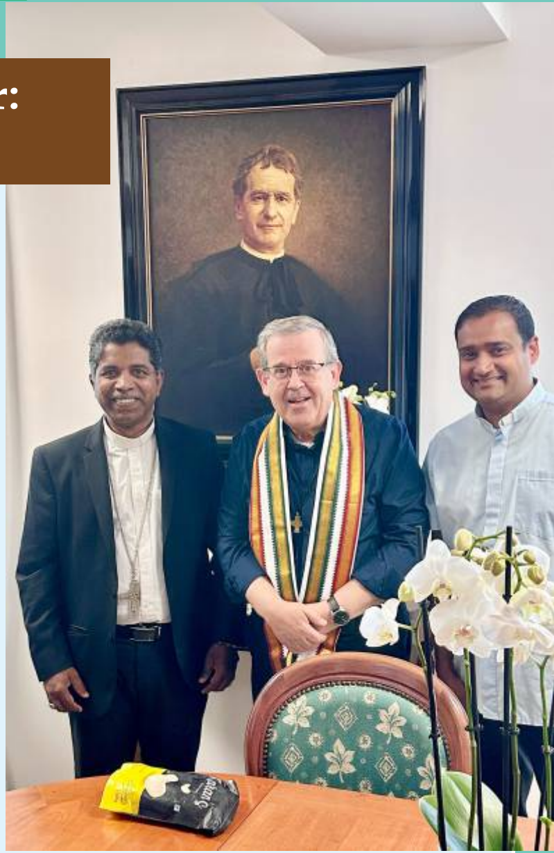
With Fr. Fabio Attard sdb Rector Major of salesian congregation