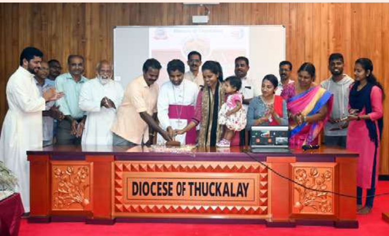
Migrants of the Diocese