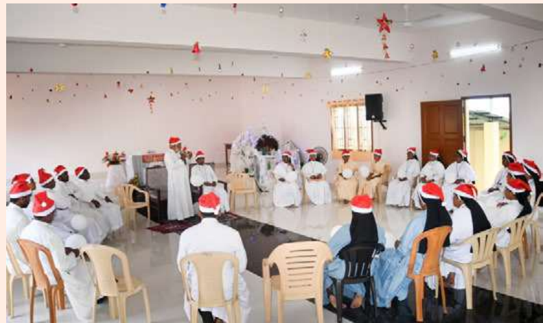
Missionaries of extended territories at Madurai

We organized many Pre-Christmas celebrations. We had Christmas Celebrations with charitable institution staff, Educational and Production Institution Staff and those of Sychar Resource Centre, Kozhiporvilai on 12 December 2022.