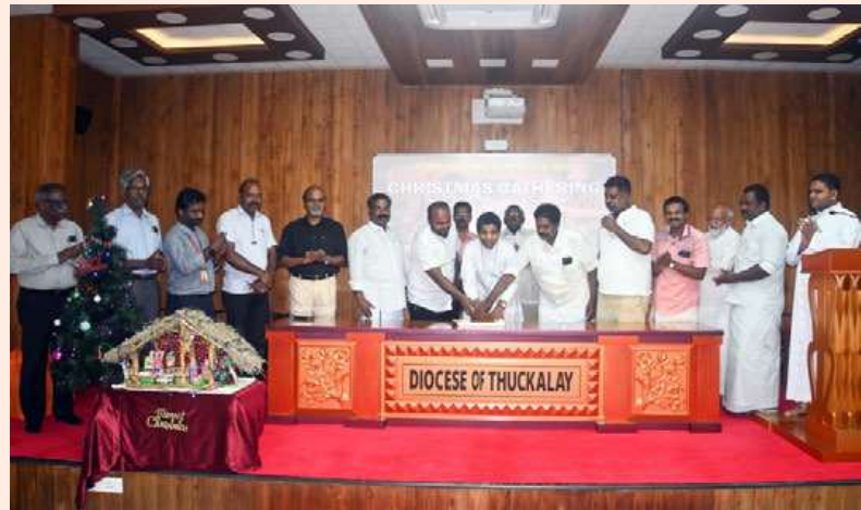
Friends and Wellwishers

There were a few Christmas celebrations on 17 December 2022 with Conference of Religious of India (CRI), the catechesis department , the Family Apostolate and Tenkasi Mission .