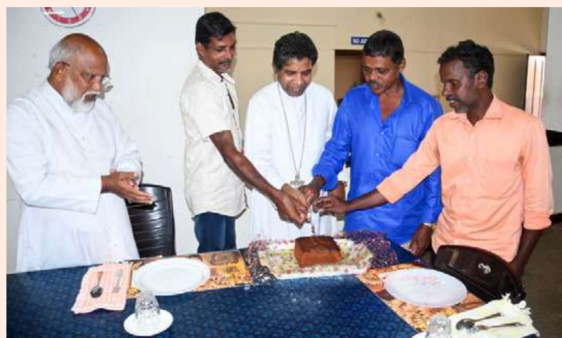
Sychar Resource Centre, Kozhiporvilai