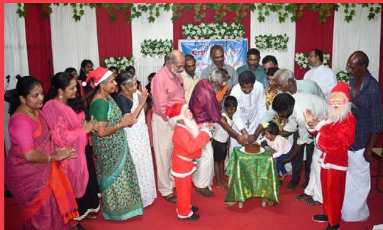
Neighborhood of Bishop's House