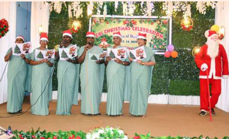
Conference of Religious of India