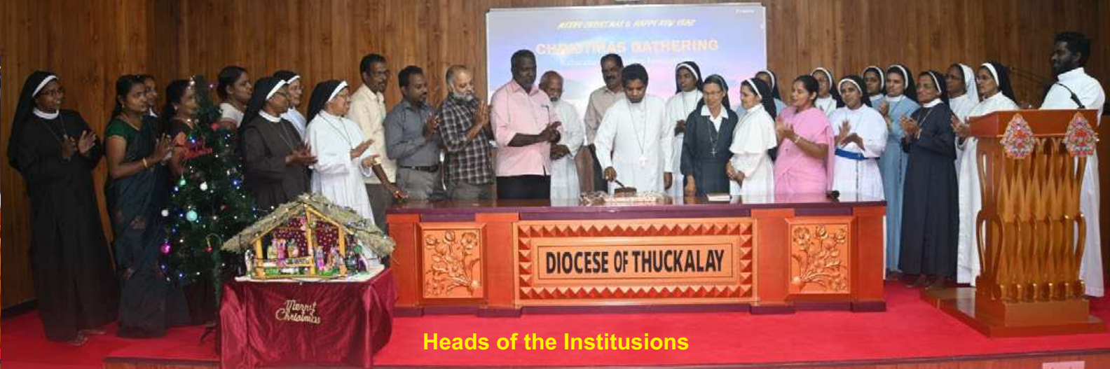
Heads of the Institutions

The neighborhood of Bishop's House and the staff of Bishop's House participated in the celebrations on 23 December 2022.