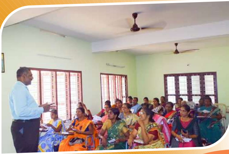
Cancer awareness Program for the Animators