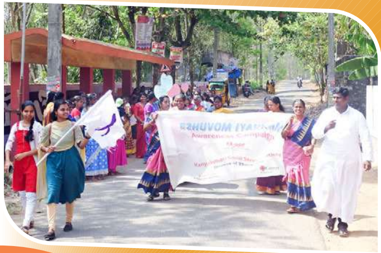
Cancer awareness rally at Mukootukal